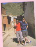
1 a photo