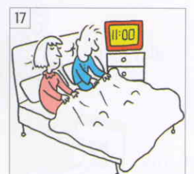
go to bed