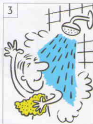
have a shower