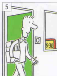
go to university