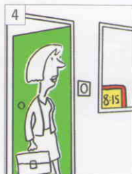
go to work (by bus, car, etc.)