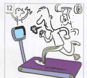
go to the gym /dʒɪm/