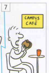
have a sandwich