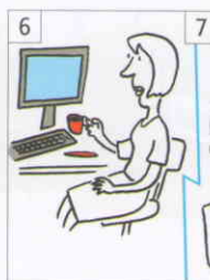
have a coffee