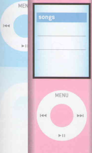
Ask your partner's opinion of the singers and groups.