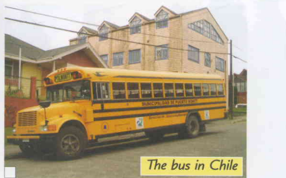
The bus in Chile