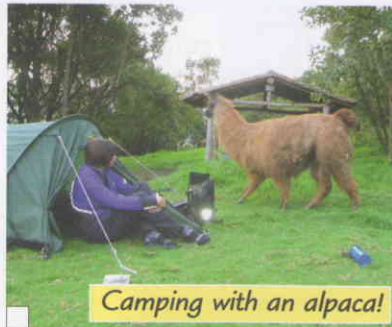
Camping with an alpaca!