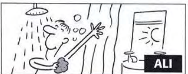
✓✓✓✓✓ / a shower in the morning