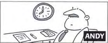
✓✓✓✓✓ / start work at 8.00