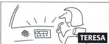
✓✓XVV / to the radio in the car