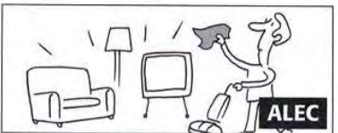
XVXXXV / housework on Saturdays