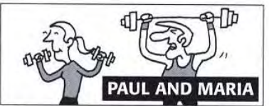
XVXXXV / gym in the evening