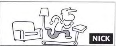
✓✓XVV / exercise in the evening