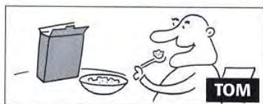
✓✓✓✓✓ / cereal for breakfast