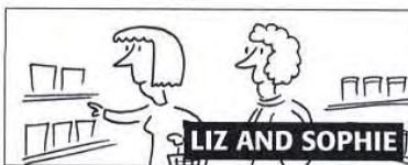
✓✓✓✓✓ / shopping on Saturday morning