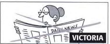
XXXXX / newspaper