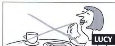
XXXXX / coffee after lunch