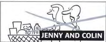
XXXXX / supermarket on Saturday