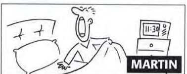
✓✓XVV / to bed at 11.30