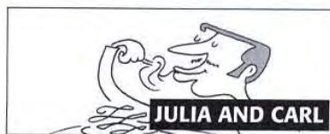
XVXXXV / pasta for dinner