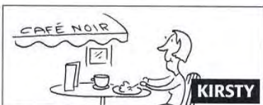
XVXXXV / lunch at a café