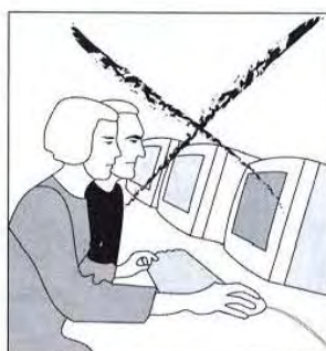
6 not check their emails