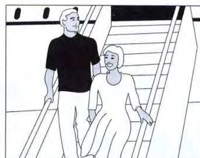
10 come back happy

a Look at the pictures. Write sentences in the past simple.