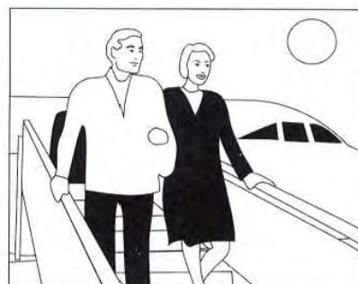
3 arrive in California