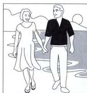
7 walk on the beach