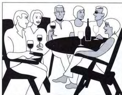
9 meet new friends