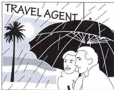
1 want a holiday