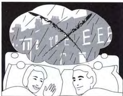
8 not think about home