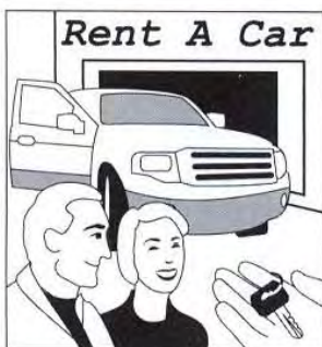
4 rent a big car