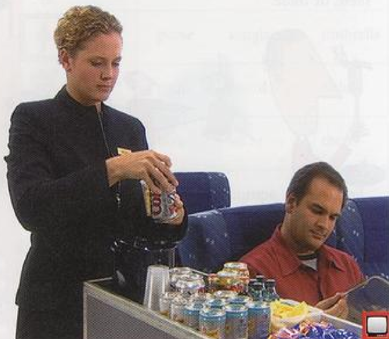
Mark is American. He works for MTC, a music company. He's on a plane to the UK.