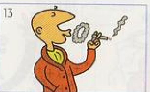
13 a cigarette