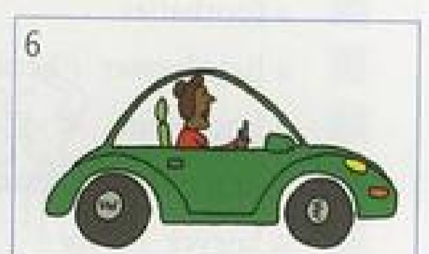
6 a VW