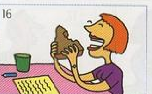
16 a sandwich for lunch