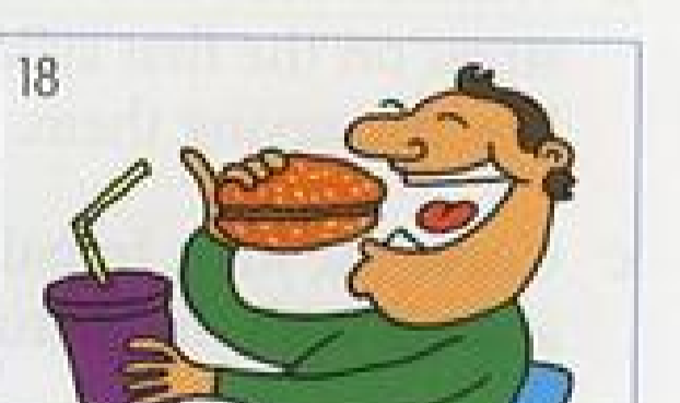
18 fast food