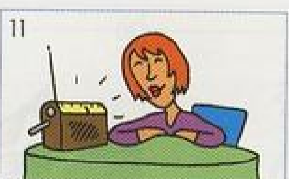
11 to the radio