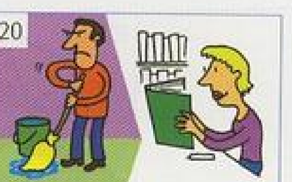
20 housework / homework