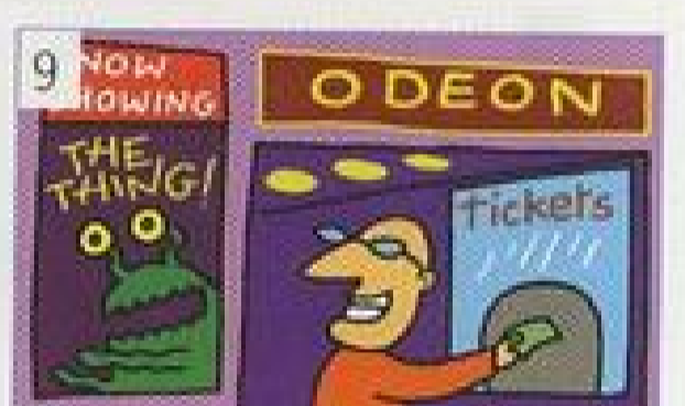
9 to the cinema