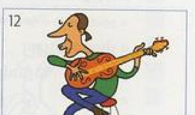
12 the guitar