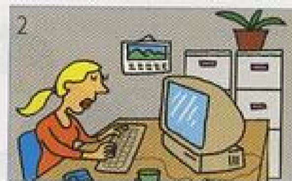
2 in an office