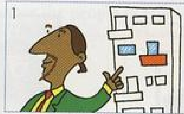
1 in a flat