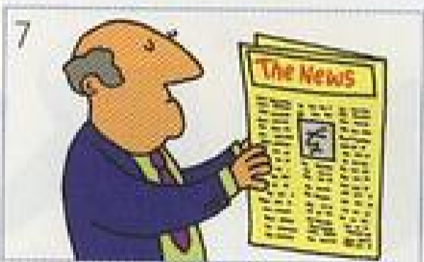
7 a newspaper