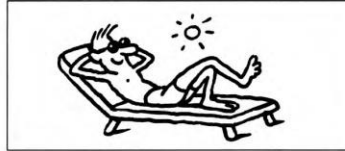
have a holiday