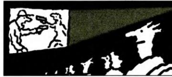
go to the cinema