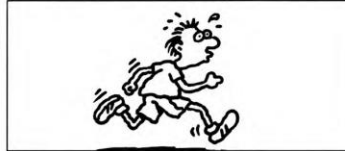
do sport or exercise