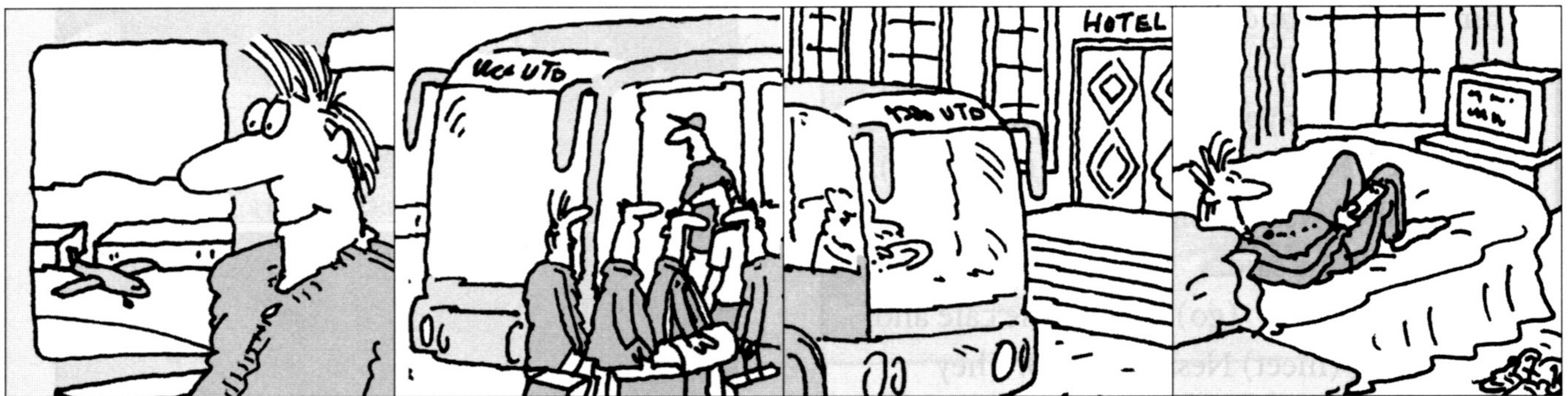
5 land in Milan