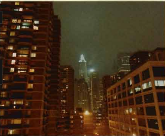
Two-bedroom apartment, Manhattan, New York City

This house is perfect for families or two couples. It's a no-smoking house and, sorry, no pets.