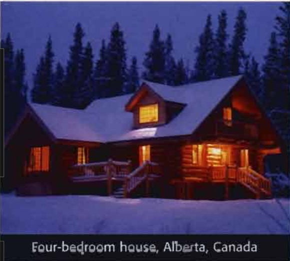
Four-bedroom house, Alberta, Canada

Would you like to stay in this beautiful house in the heart of the Canadian Rocky Mountains?