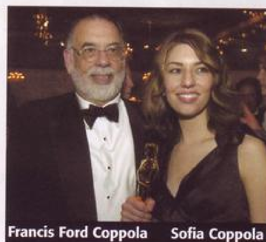
Francis Ford Coppola Sofia Coppola