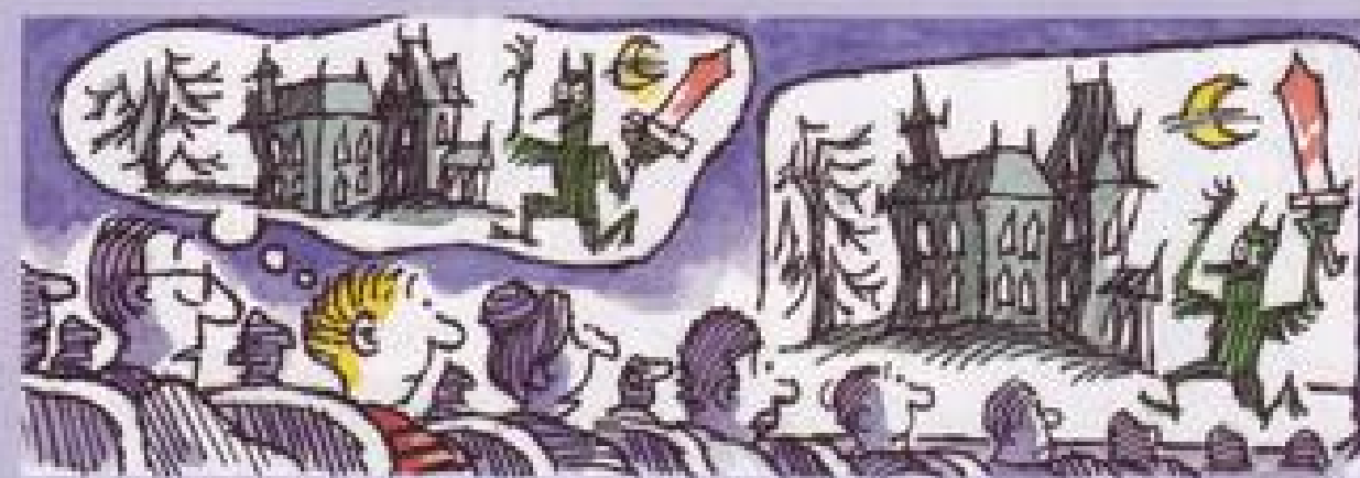
Suddenly he remembered that he had seen the film before.